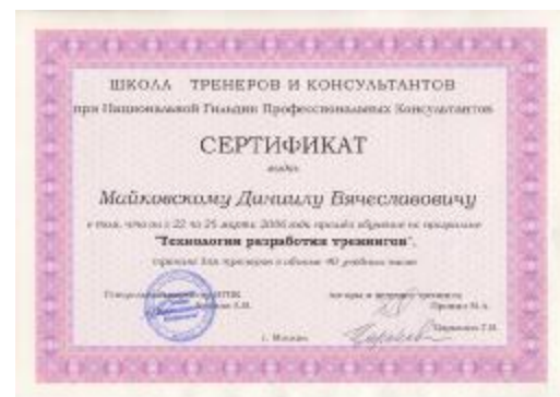
Certificate of Trainers & Consultants School of Professional Consultant's National Guild