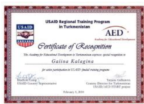
Certificate of Recognition Academy for Educational Development