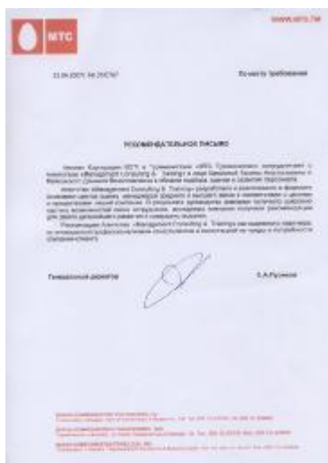
Letter-Recommendation of BCTI Corporation Branch in Turkmenistan "MTC Туркменистан"