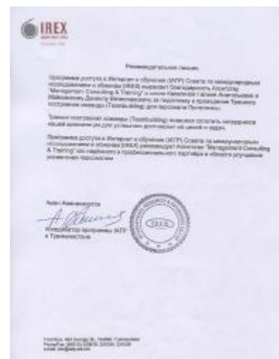
Letter-Recommendation of International Research and Exchange Board (IREX), US